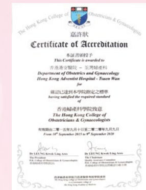
Hong Kong College of Obstetricians and Gynaecologists 香港婦產科學院