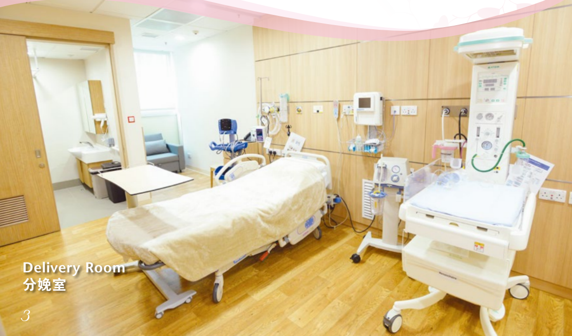
Delivery Room 分娩室

本院產科部的房間乃經特別設計，其鑲入式燈光設計可調節照射角度和亮度，睡床乃經特別設計的產床。準媽媽毋須於臨盆時轉移至產房，可直接在入住的分娩室自然分娩，在至親與專業人員的陪伴下迎接新生命，倍添安心和舒適。