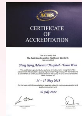
Australian Council on Healthcare Standards 澳洲醫療服務標準委員會