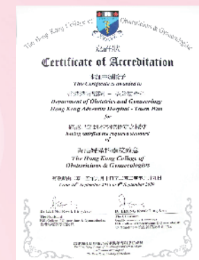
Hong Kong College of Obstetricians and Gynaecologists 香港婦產科學院