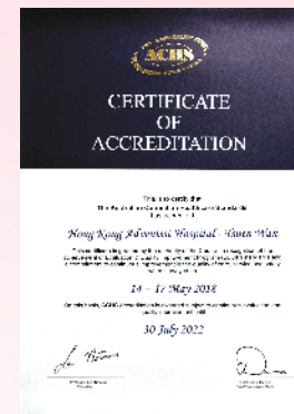
Australian Council on Healthcare Standards 澳洲醫療服務標準委員會