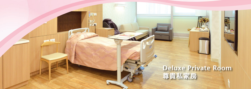
Deluxe Private Room 尊貴私家房

嬰兒出生後，醫護人員會隨即為他們戴上電子條碼腳環。唯有由戴上配對腕環的母親抱起嬰兒，保安感應系統方會發出確認聲音。若有其他人抱起嬰兒，或嬰兒被帶離產科病房，保安系統便會立即啟動警報。