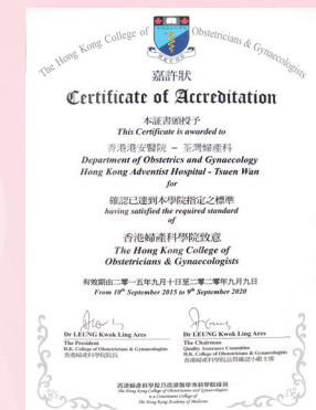
Hong Kong College of Obstetricians and Gynaecologists 香港婦產科學院