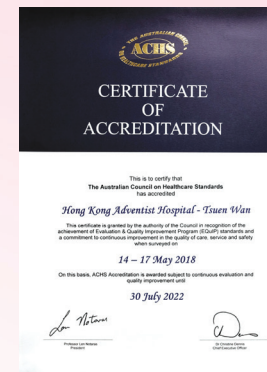
Australian Council on Healthcare Standards 澳洲醫療服務標準委員會