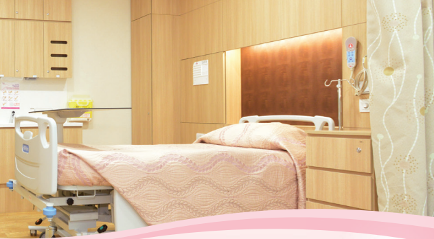
Premium Private Room 優質私家房