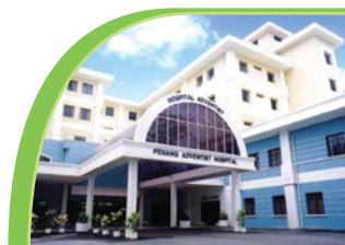
Penang Adventist Hospital 檳安醫院