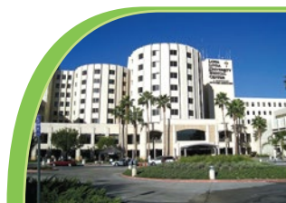
Loma Linda University School of Medicine 羅馬琳達大學醫學院

基督復臨安息日會於世界各地共擁有逾一百七十所醫院和四百三十間醫療機構，組成了一個全球性的醫療網絡。香港港安醫院—司徒拔道及荃灣亦是其中一份子，而美國加州羅馬琳達大學醫學院更是當地著名的醫學訓練中心。