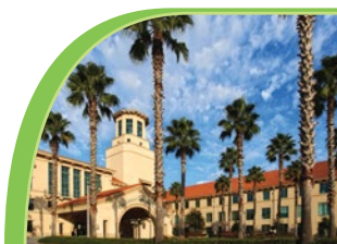
Florida Hospital Celebration Health 佛羅里達醫院