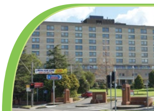
Sydney Adventist Hospital 悉尼港安醫院