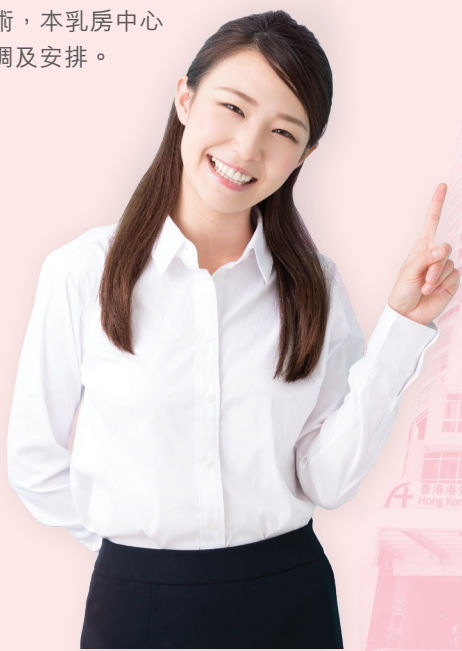
Hong Kong Adventist Hospital - Tsuen Wan