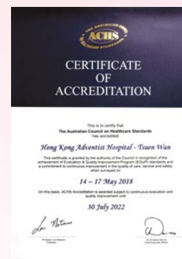
Australian Council on Healthcare Standards 澳洲醫療服務標準委員會