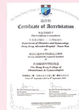
Hong Kong College of Obstetricians and Gynaecologists 香港婦產科學院